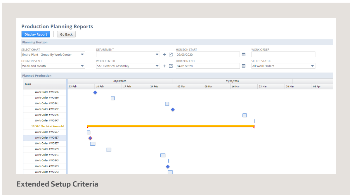
Extended Setup Criteria

You can seamlessly upgrade from one edition to another.