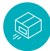
Shipping and Return Centers