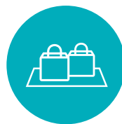
Pick Up Places